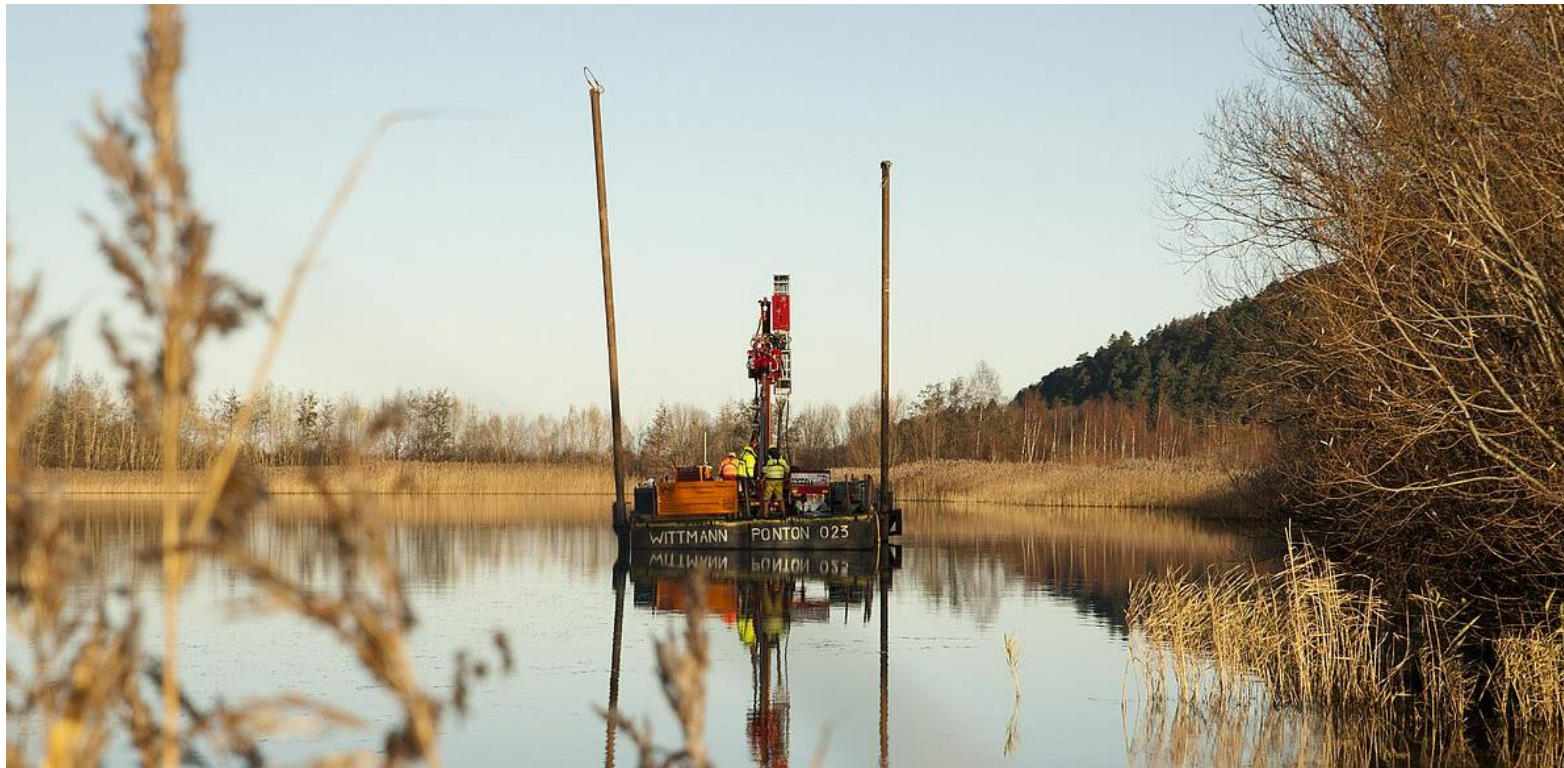
The tailing pond in Goslar, Source: TU Clausthal