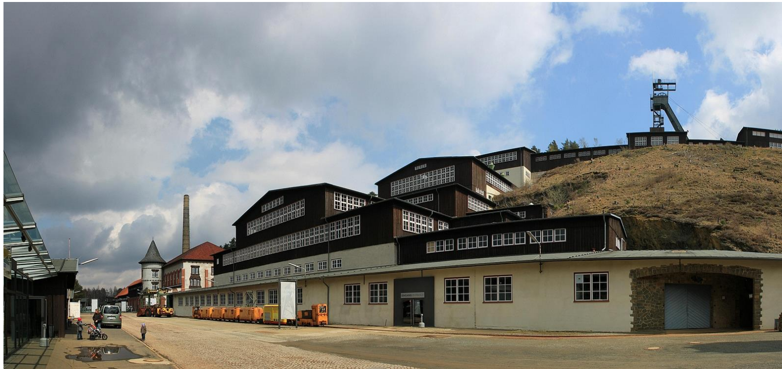
The Rammelsberg mine, UNESCO World heritage site.