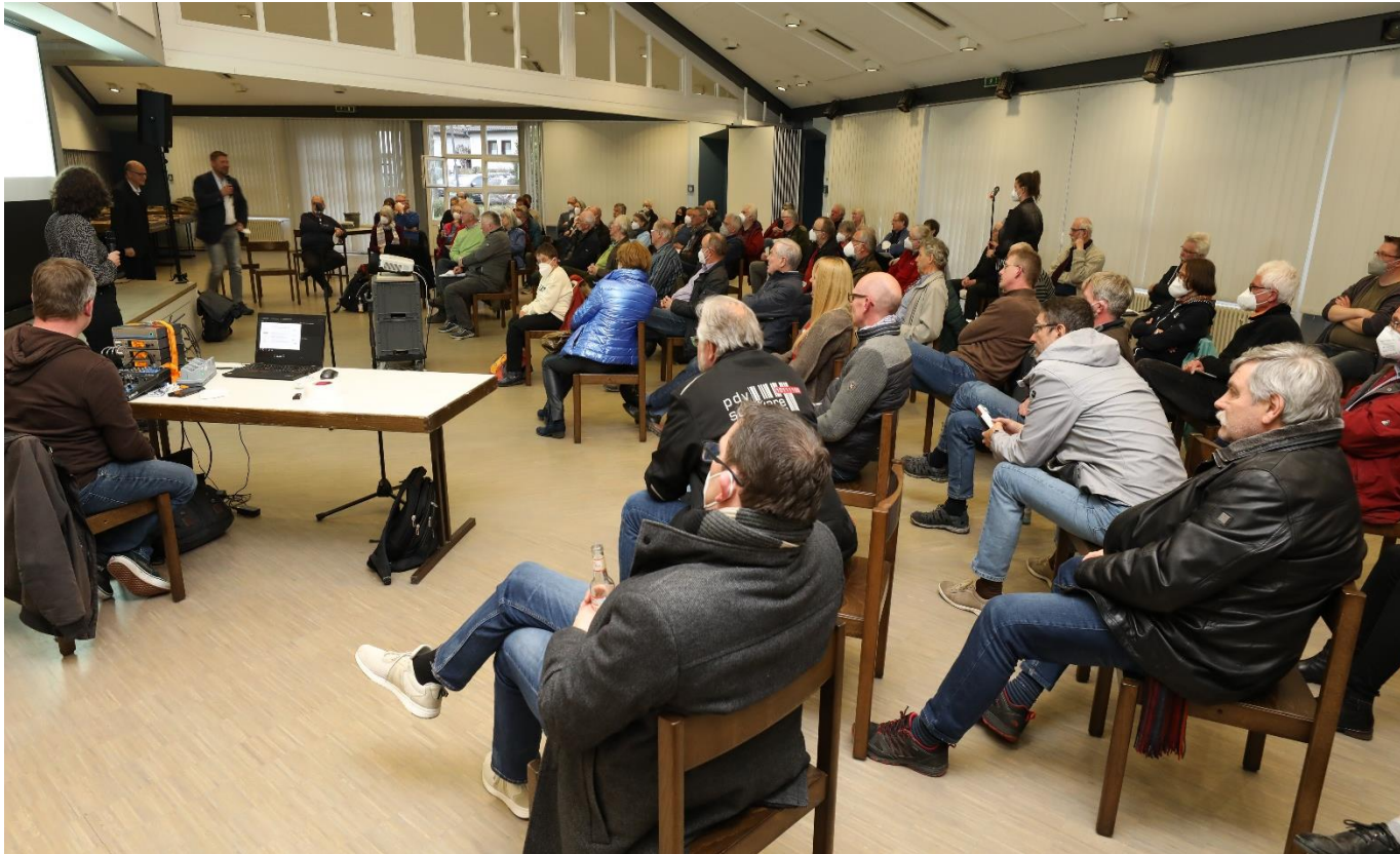
The workshop with locals.